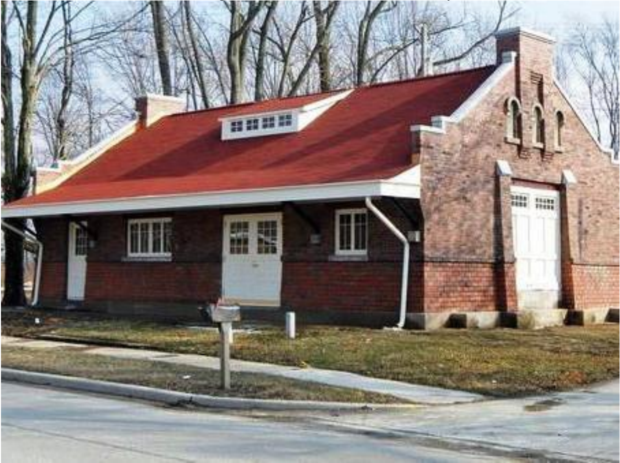
(Above) Russiaville, IN interurban train depot along highway IN-26

At home, I did some research on the depot. I found that the line behind the depot was an interurban line that ran from Russiaville to Kokomo to Frankfort to Marion. The line dates back to 1907 although the section in Russiaville was not built until 1910. The depot itself (pictured below) was one of the few buildings that survived a 1965 Palm Sunday tornado.